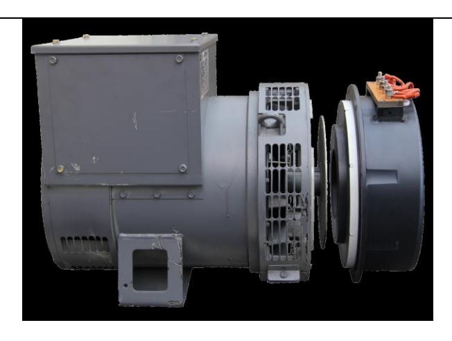
Figure 1, a Leroy Somer Alternator rated at 20 kVA (16 kW), popularly used by Caterpillar and other major AC Generator producers, next to the Polar model 8220 "DC" alternator, rated at 16 to 22 kW (depending on RPM).

A common sense comparison of alternators